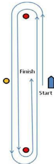
Figure 2 – Course B

For Course B on legs 2 & 3 the Start / Finish marks are not marks of the course. The start / finish line is open.